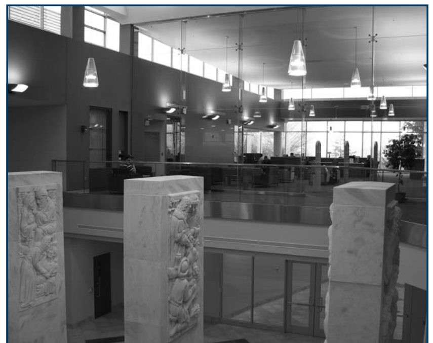
The landmark Pylons serve as a centerpiece for the new Health Sciences Library and Learning Center.