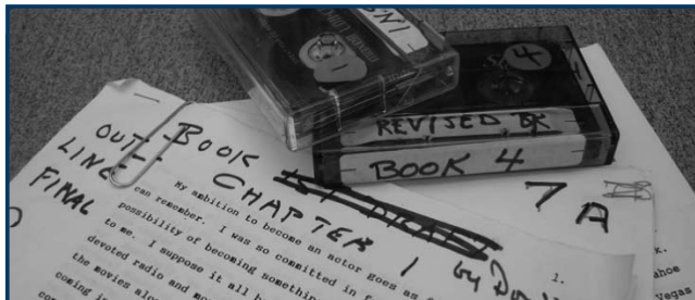
A manuscript and audio cassette tapes provide an intimate look into Don Knotts' life.

freshmen and making them shout that famous cheer.